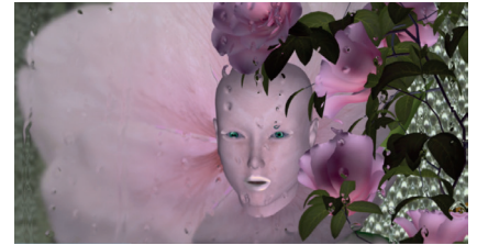
Pinar&Viola, Mother Earth , 2019.

With Woman Go No'Gree , Gloria Oyarzabal (Rocio Santa Cruz, Barcelona) examines the role of colonialism in the imposition of a social order based on gender differentiation in Africa. Ghost Stories by Federico Clavarino (Viasaterna, Milan) interweaves anecdotes from the history of Marseille with portraits of today's youth in a story that emphasises the narrative power of images. In Margins of Excess , Max Pinckers (Sofie Van der Velde, Antwerp) evokes a series of deceptions as a means to scrutinise the tenuous gap between reality and fiction, and questions the social structures that organise our collective narratives. Then, with Ora , Sébastien Arrighi (Myo, Mougins) reveals a mysterious and harsh Corsica where mystical beliefs and social realism converge.